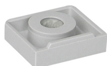
085 4 XXX

accessories BIS starQuick® Pipe Clamps without Nut